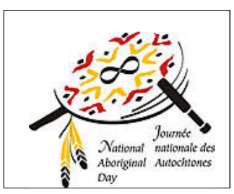
NATIONAL ABORIGINAL DAY JUNE 21, 2009

COME OUT AND CELE-BRATE NATIONAL ABORIGI-NAL DAY WITH THE WET'SUWET'EN NATION ON SUNDAY, JUNE 21ST, 2009 AT THE BALLPARK BESIDE THE MULTIPLEX IN MORICETOWN. OPENING CEREMONIES AT 12:00 PM.